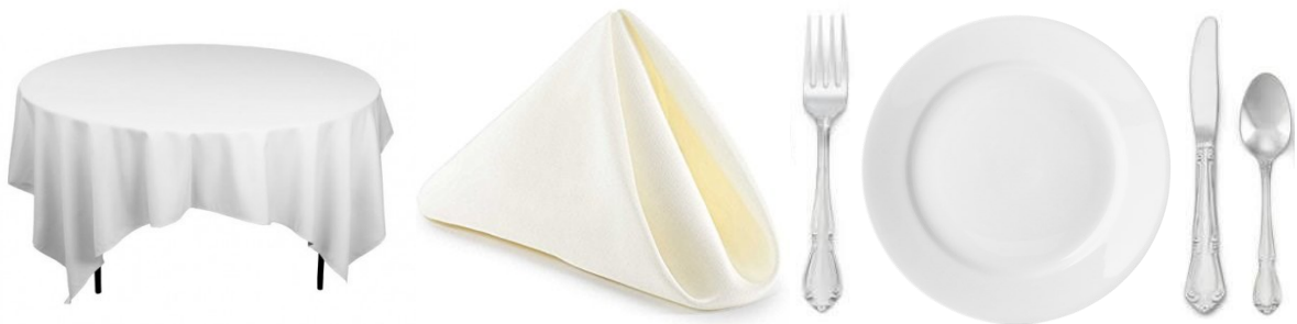
white or ivory square table linens, white or ivory napkins, china, silverware

The above equipment is included in your package. Other options available to personalize your reception at an additional charge.