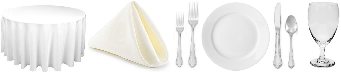
white or ivory floor-length table linens, white or ivory napkins, china, silverware, water glasses