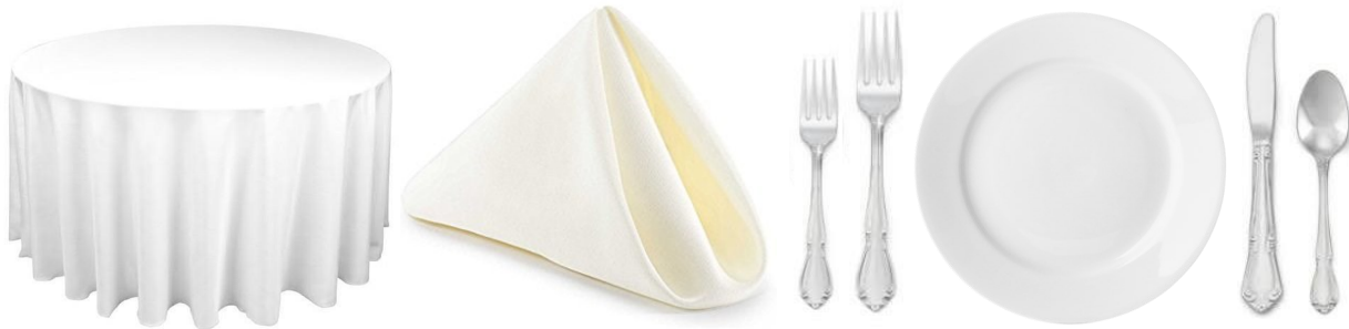
white or ivory floor-length table linens, white or ivory napkins, china, silverware