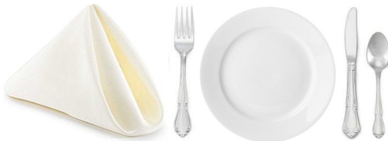
white or ivory napkins, china, silverware

The above equipment is included in your package. Other options available to personalize your reception at an additional charge.