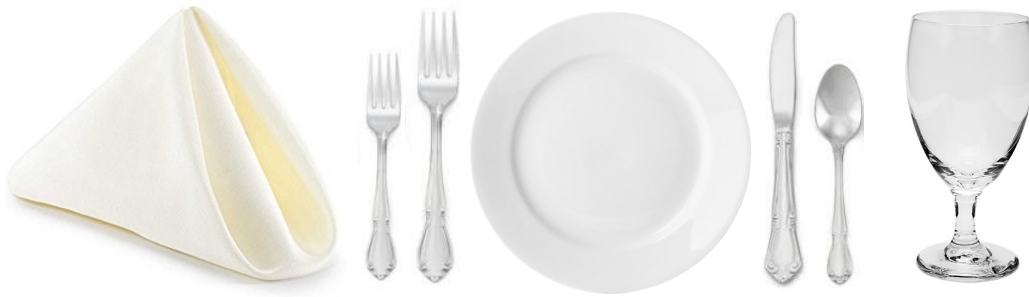
white or ivory napkins, china, silverware, water glasses