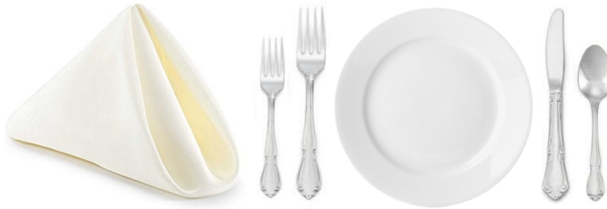
white or ivory napkins, china, silverware