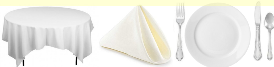
white or ivory square table linens, white or ivory napkins, china, silverware